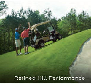
Refined Hill Performance