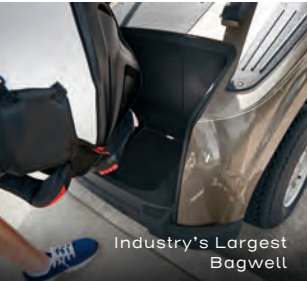
Industry's Largest Bagwell