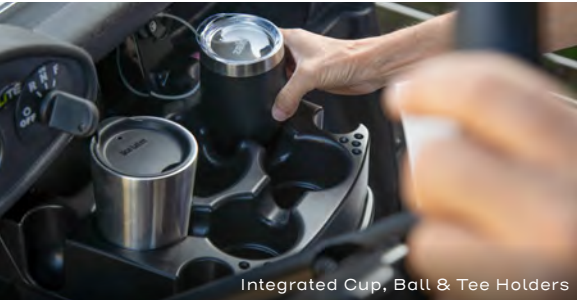
Integrated Cup, Ball & Tee Holders