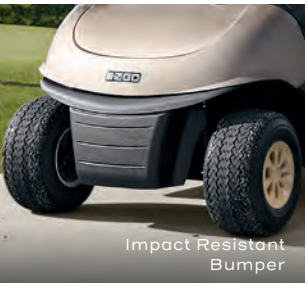
Impact Resistant Bumper